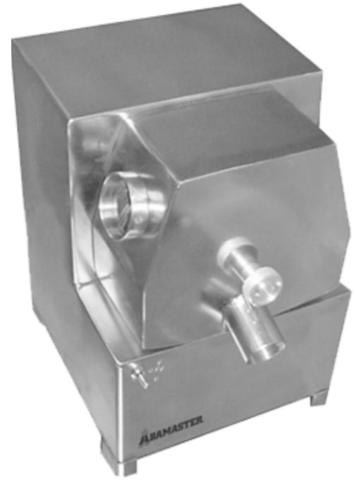
Model No. 2000